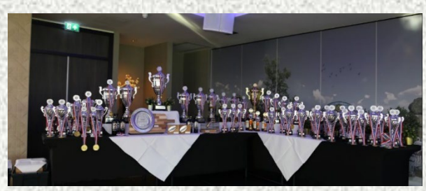
More than 60 beautiful cups